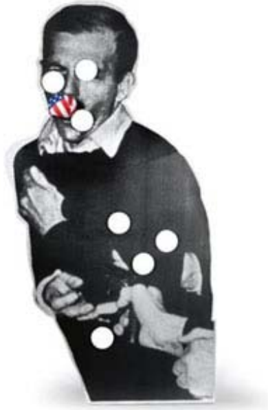
Cady Noland, "Oozewald" (1989)

until her intervention, was enmeshed in a system of exchange that seemed to point only toward higher prices? In defense of his position, Jancou forwarded Sotheby's a report prepared for him by prominent contemporary conservator Christian Scheidemann , dated 6/30/2011 but not previously shared by Jancou. The conservation report described the overall condition of the work as "very good" (the part the collector chose to highlight), while also noting that all four corners were "bent and slightly deformed" and that "some deformations ... will always be noticeable."