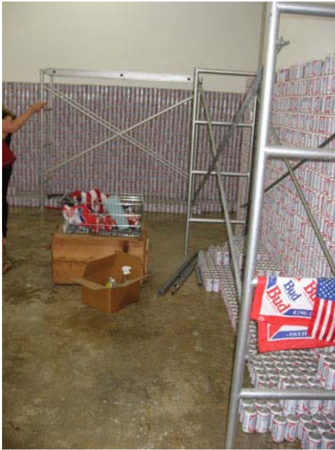
Cady Noland, “This Piece Has No Title Yet” (1989), at the Rubell Family Collection (click to enlarge)

There has been a resurgence of interest in the bleak vision of American culture that Noland mounted in the 1980s and 1990s through various combinations of objects and images — despite the fact that Noland herself has largely withdrawn from the art world. Indeed, her status as a mysteriously absent presence was confirmed by a provocative 2006 exhibition at the Triple Candie gallery, Cady Noland Approximately , where a group of artists assembled a version of a retrospective through unauthorized remakes of Noland’s work. And visitors to the Rubell Family Collection during last week’s Art Basel Miami Beach were reminded of the impact of her work via the reappearance of her major Budweiser installation, with its complete overload of the class- and gender-identified brew, in her 1989 “This Piece Has No Title Yet.”