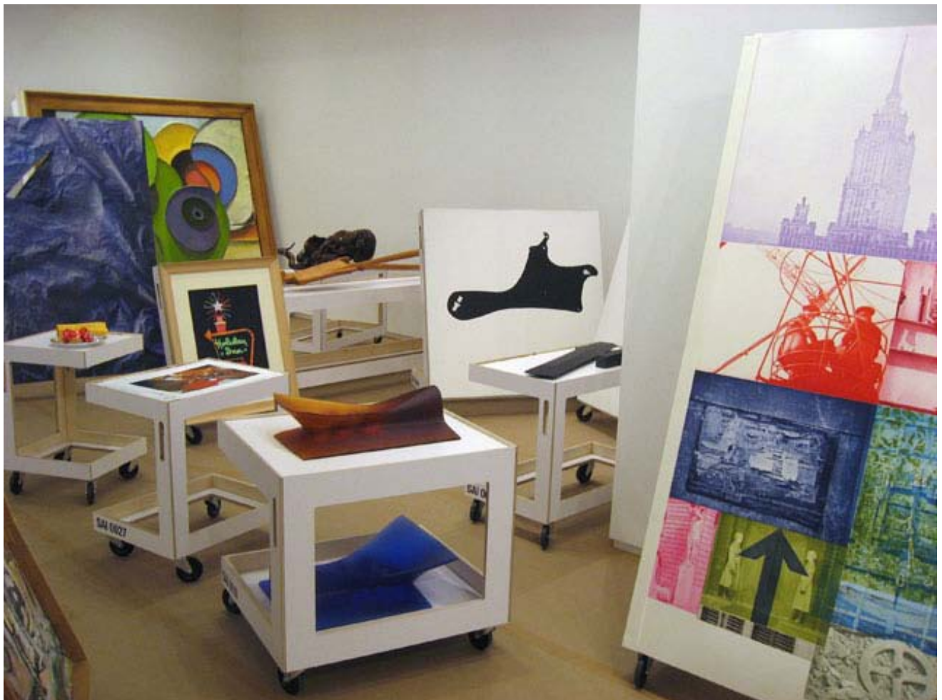
Installation view, "No Longer Art" (2012)