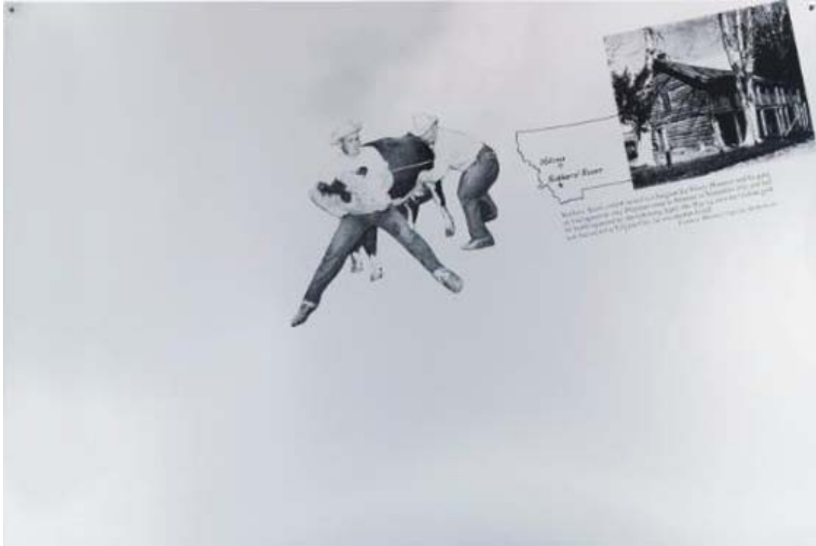
Cady Noland, "Cowboys Milking" (1990)