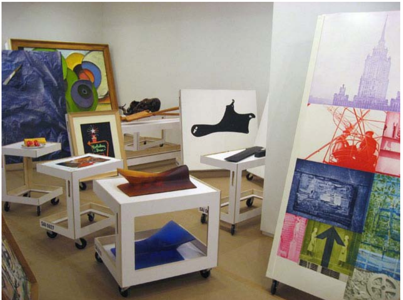
Installation view, "No Longer Art" (2012)